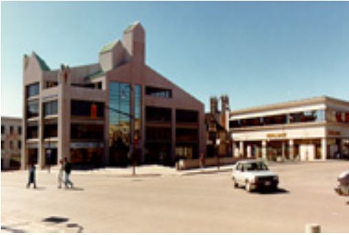
42 Wyndham St N, Guelph