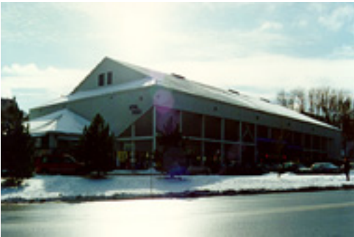
Royal Plaza, Guelph