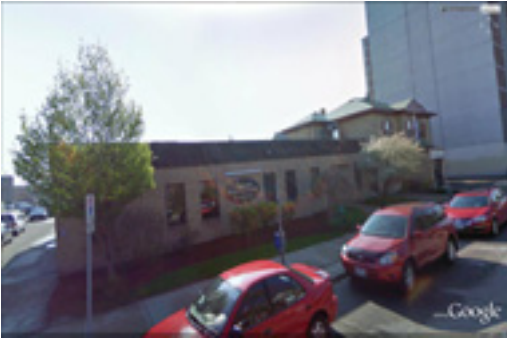
21 Yarmouth St, Guelph