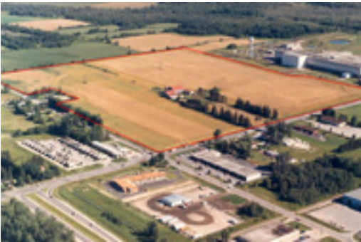
Northwood Business Park, Guelph