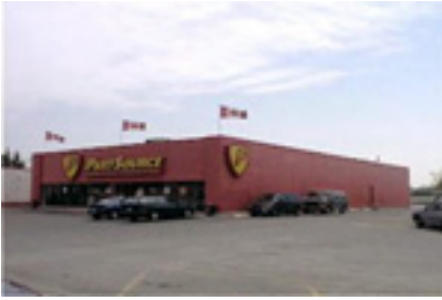
65 Victoria Road South