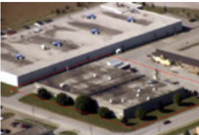
589 Massey Road

Major Tenant: Partsource (Canadian Tire Corporation)