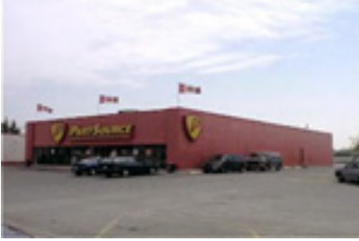
65 Victoria Road South